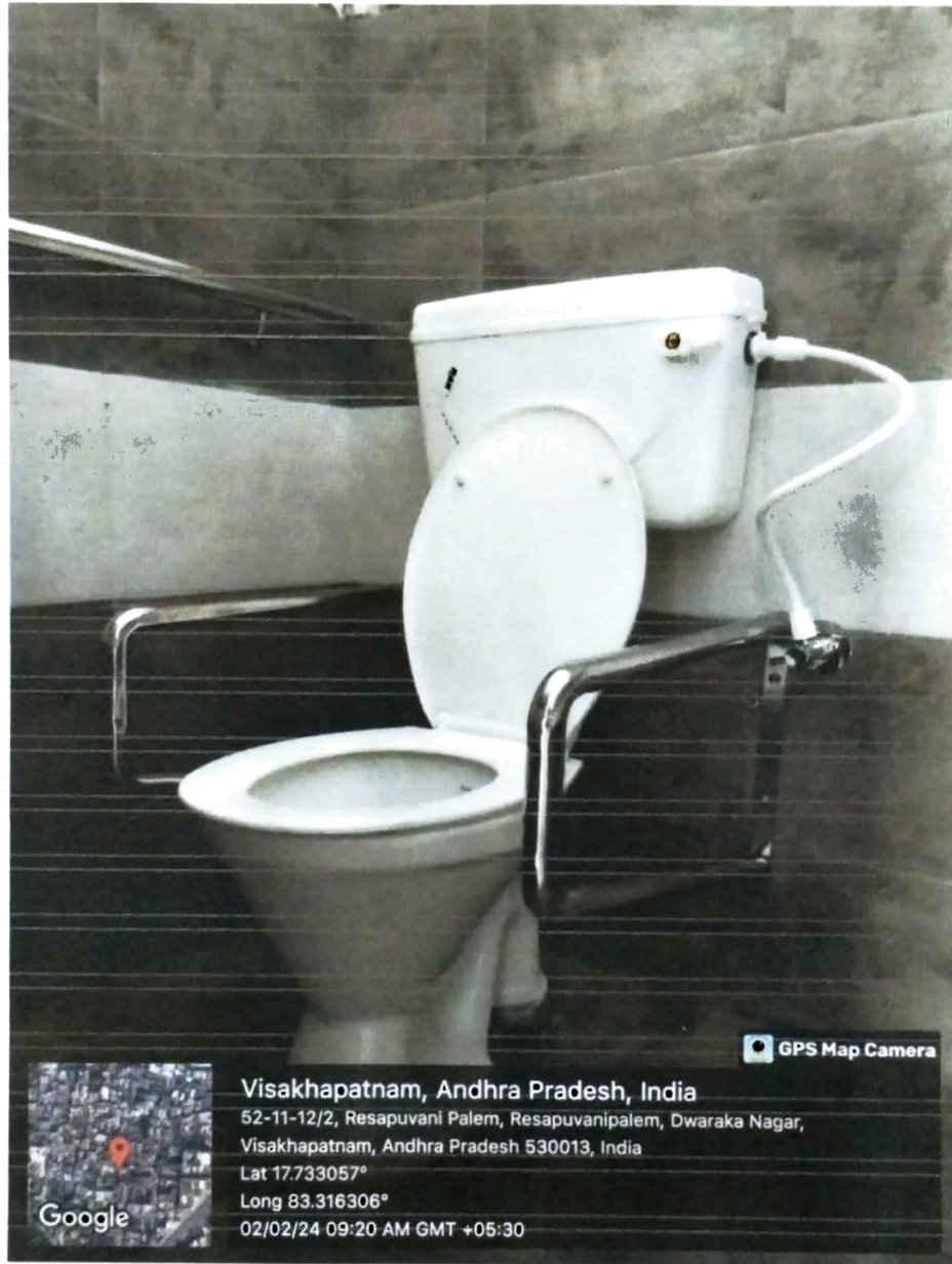
Toilets for Divyangjan

Approved by AICTE, Affiliated to Andhra University