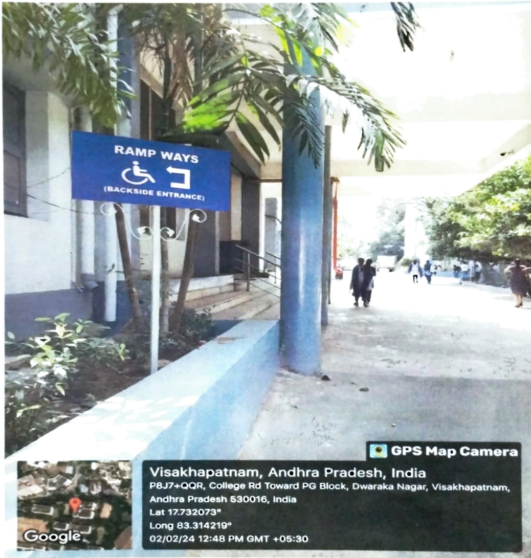
Direction boards of Ramp ways for Divyangjan

Approved by AICTE, Affiliated to Andhra University