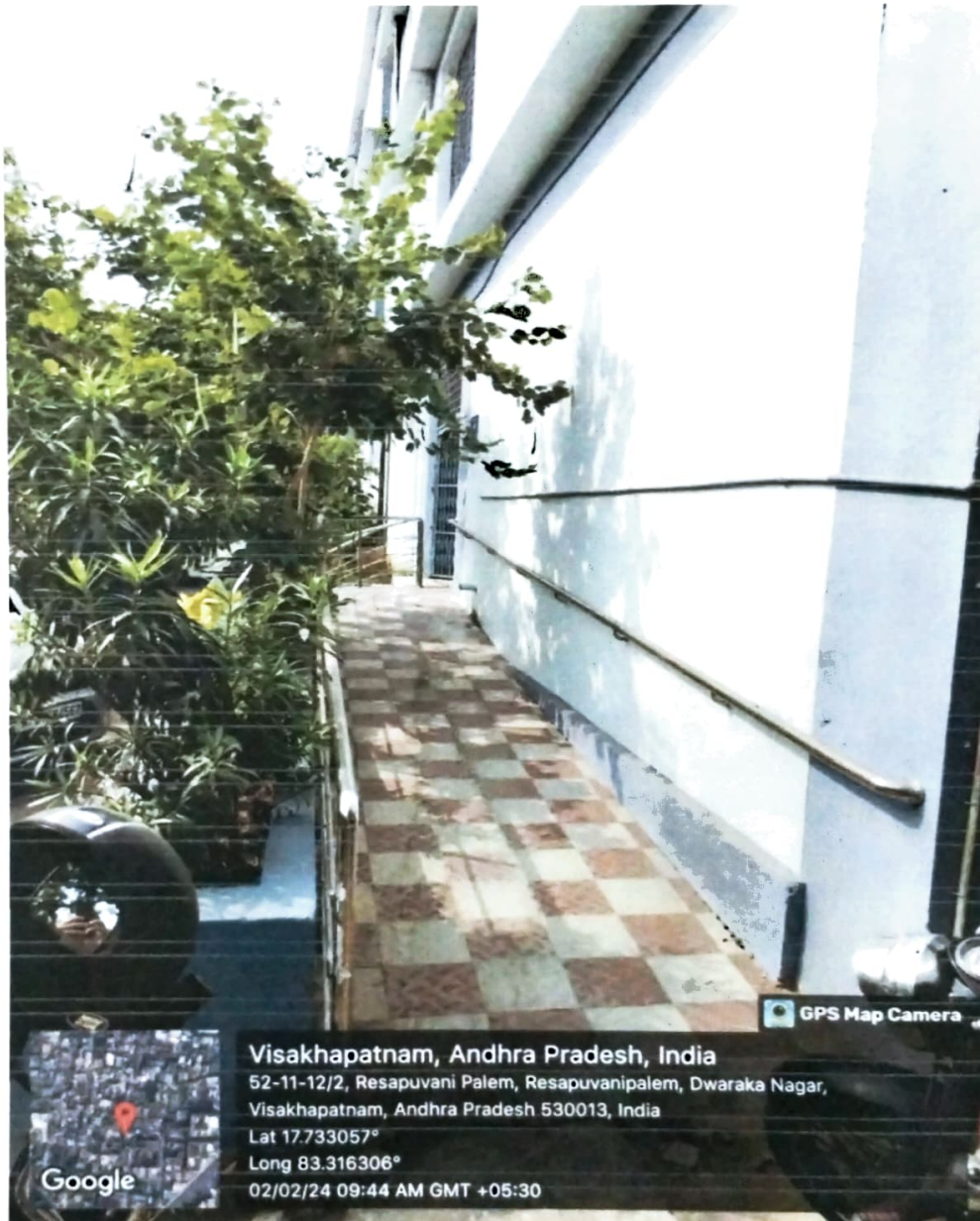
Ramp ways for Divyangjan

Approved by AICTE, Affiliated to Andhra University