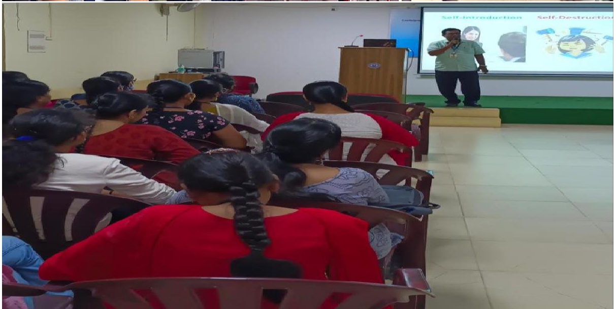
Students actively participating in the session.