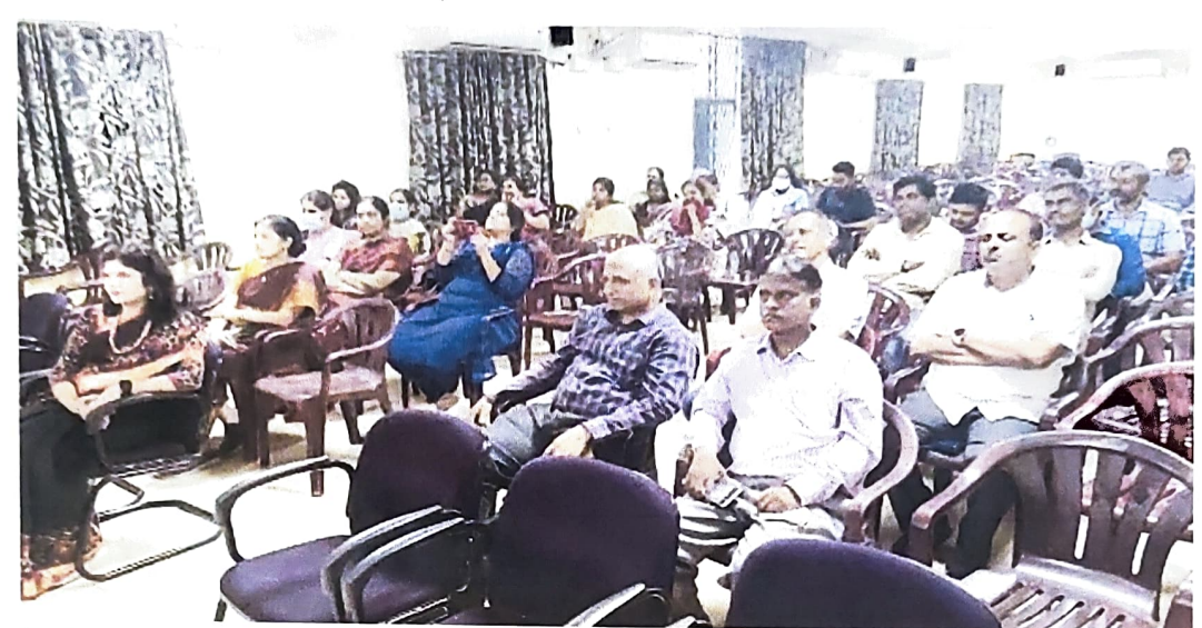
Photo5.Faculty Members participating in the sesssion