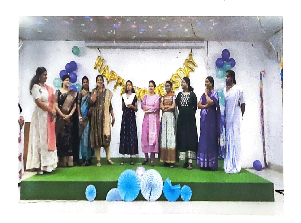
Photo8.Participants of the Cultural programme