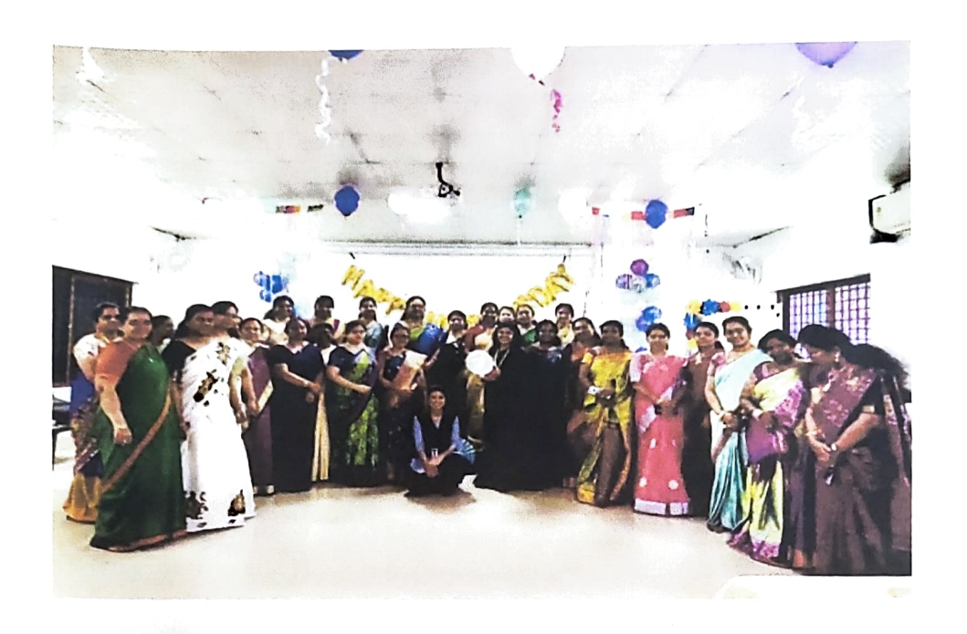
Photo7.Participants of the Cultural programme