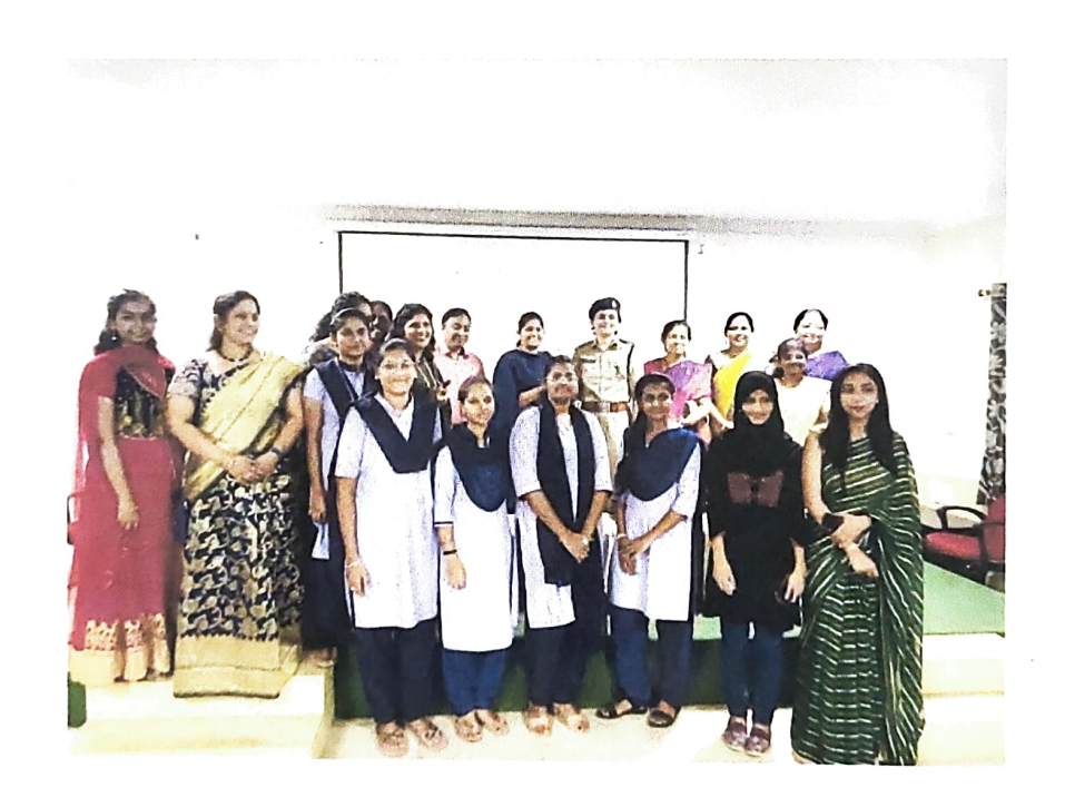
Photo6.Group Photo of the Chief Guest with Staff and students