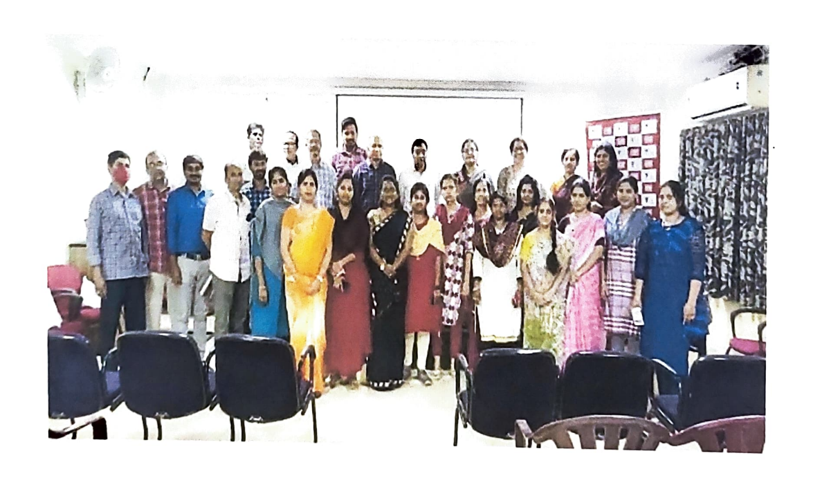
Photo6. Faculty Members who Participated in the session