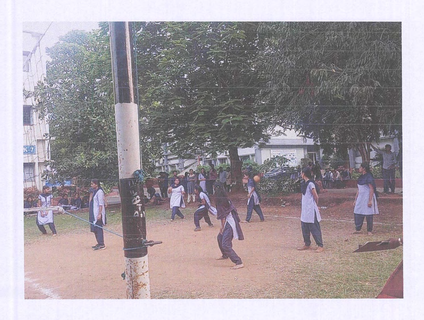
Photo2. Throw Ball Tournament in Progress