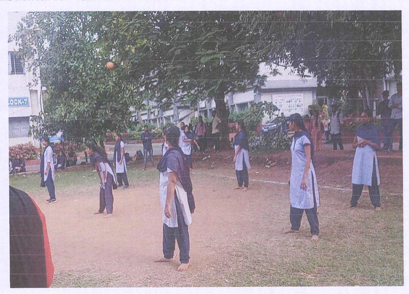
Photo1. Throw Ball Tournament in Progress

In order to inculcate competitive spirit and encourage the Students to actively pursue Sports, Dr.Lankapalli Bullayya College of Engineering for Women conducted Throw Ball Tournament Four teams from the College participated in this event. I B.Tech CSE Team were the winners and II B.Tech CSE Team were the Runners.