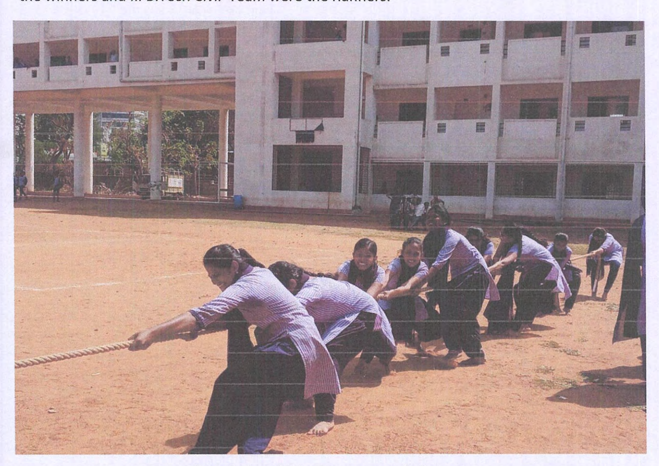
Photo1.Tug of War Tournament in Progress

In order to inculcate competitive spirit and encourage the Students to actively pursue Sports, Dr.Lankapalli Bullayya College of Engineering for Women conducted Tug of War Tournament . Four teams from the College participated in this event. II B.Tech & III B.Tech CSE Team were the winners and III B.Tech Civil Team were the Runners.