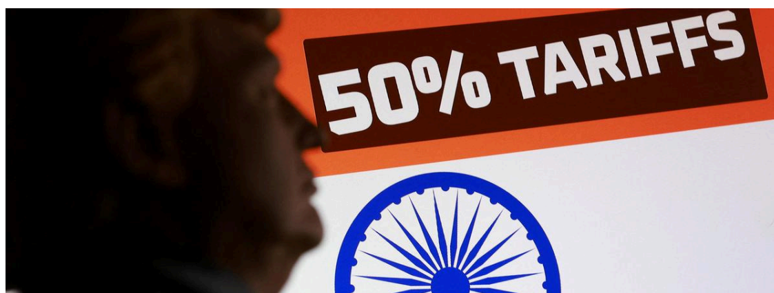
Illustration of the Indian flag in the backdrop of a model depicting U.S. President Donald Trump as the U.S. imposes 50% tariff

According to the Global Trade Research Initiative (GTRI), about two-thirds of India's annual goods