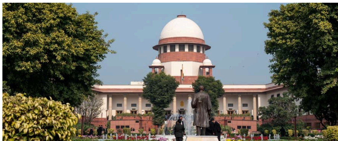
Supreme Court of India